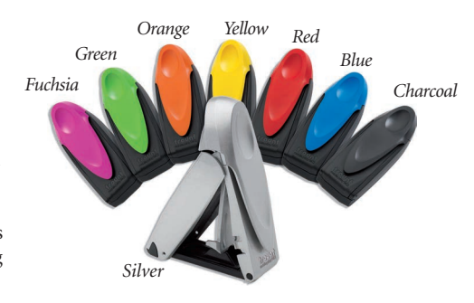
If no stamp color is specified, you will receive Charcoal,

This new compact stamp is perfect if you are always on the go. Its slim design makes it convenient for traveling, while still producing crisp, clear impressions. It is also as easy to use as it is portable, making it a great addition to your regular notary stamp. (Choose stamp case color on front.)